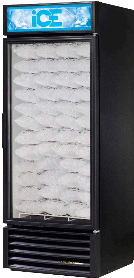
Shown with optional black exterior.