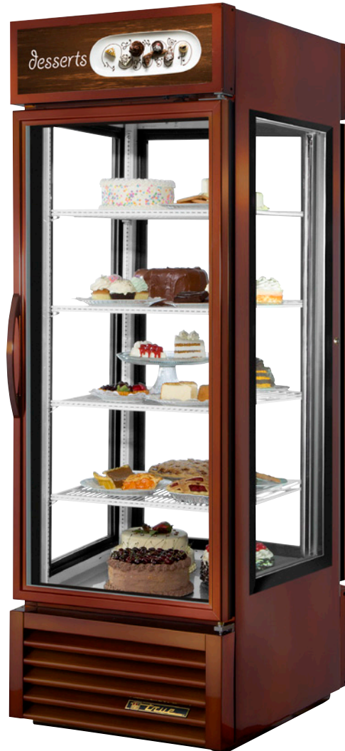
Shown with optional Dessert Sign.

Swing Door Pass-Thru Refrigerator with LED Lighting