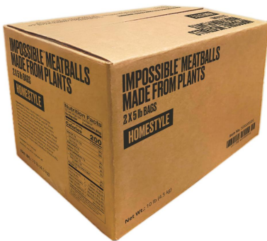
Figure A. Case