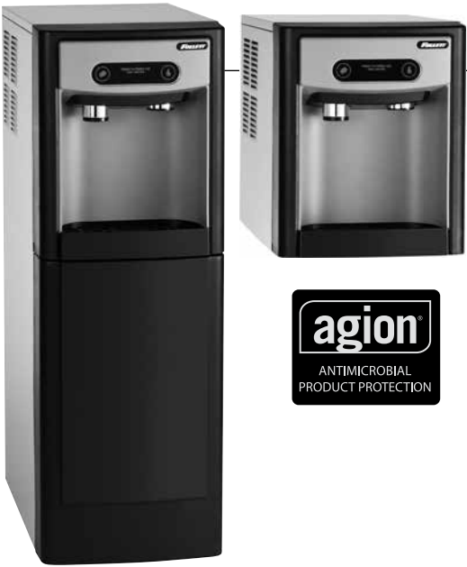
Shown with optional base stand

NOTE: For use in applications with greater than 5 mg/l but less than 400 mg/l total dissolved solids in water and less than 200 mg/l hardness (either naturally occurring or treated with reverse osmosis or other TDS reducing technology).