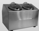
CC-LTC-2SW 2-Hole Insulated