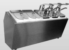
IUD-5H 5-hole Insulated Highboy with Accessories