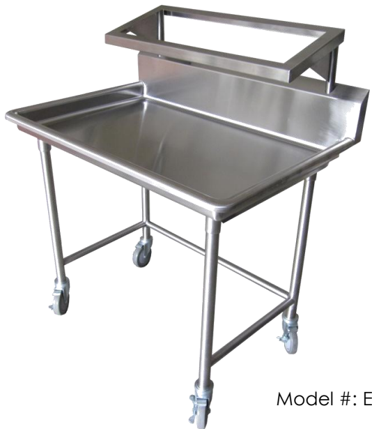
Model #: E1-STE-2H