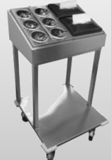
E1-FTA-1V Flat Top Adapter