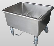
E1-SK-2 E1 Two-Basket Soak Sink