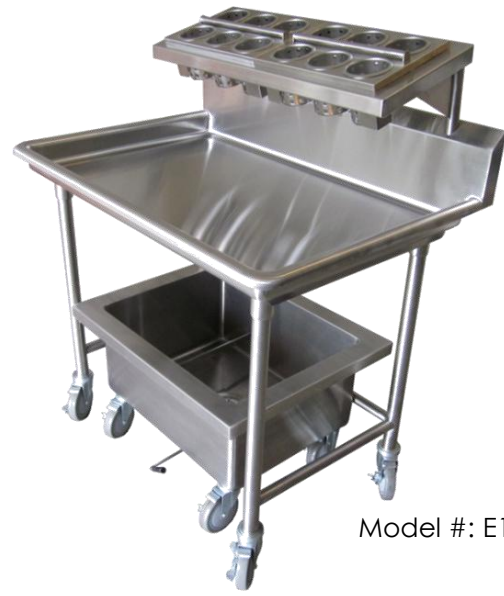
Model #: E1-LSS-W