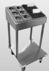
E1-FTA-1V Flat Top Adapter

See the E1 System pages for additional dispensing options, accessories and details