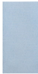
INDIGO DINNER NAPKIN