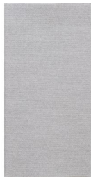
ONYX DINNER NAPKIN