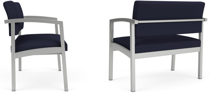
Lenox Steel Bariatric Chair