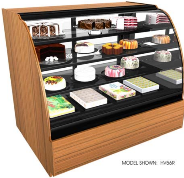
MODEL SHOWN: HV56R