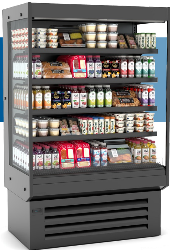
Case shown with premium view ends