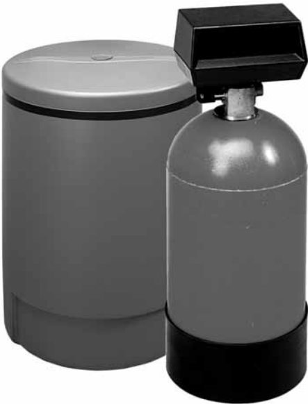
HWS050 Rated for 16,000 grains per tank, 5 gpm (18.9 lpm) service flow, 150°F (65.6°C)