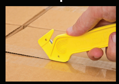
Poke splitter into tape and pull <u>DO NOT</u> use blade to cut tape