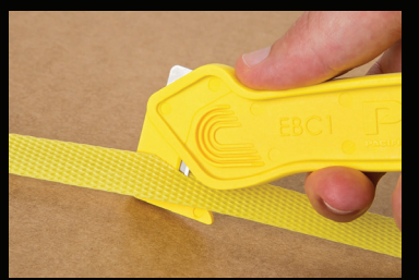
Always cut at a 45 degree angle