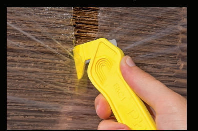
Hold film taught with opposite hand and cut downward