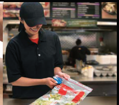
Cut For Resealing