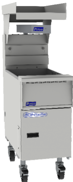
SSHBNB75 with optional food warmer, top shelf and casters