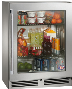
HD24RS4 Shown with Glass with Stainless Steel Frame Door (S)