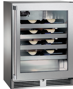
HD24WS4 Shown with Glass with Stainless Steel Frame Door (S)