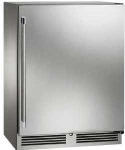
HD24RS4 Shown with Solid Stainless Steel Door (S)