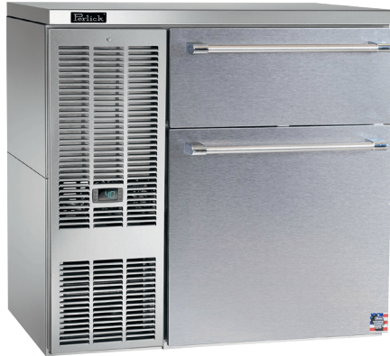
BBS36 with optional liquor drawers shown