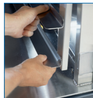
Removable Ledge Panels