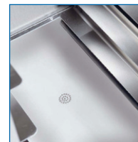
Interior Floor Drain