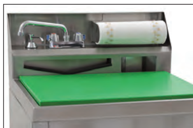
shown with acrylic plate removed