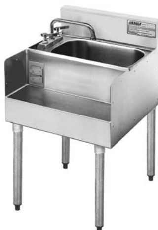
sink step-down unit