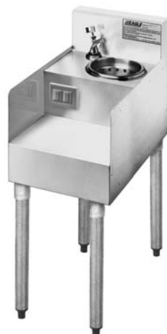
liquid waste step-down unit

Eagle (1800 / 2200 Series) Modular Add-On Step Down Sink Unit, model _____. Top, front and backsplash to be heavy gauge type 304 stainless steel. Furnished with 15-amp 120-volt duplex, GFCI receptacle with waterproof cover plate, and 10" x 14" x 10" deep-drawn sink with faucet and basket drain. Predrilled mounting holes on both sides. Two KD channel/gusset and galvanized leg assemblies with adjustable bullet feet furnished.