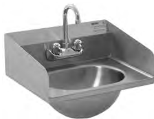
hand sink with optional end splashes