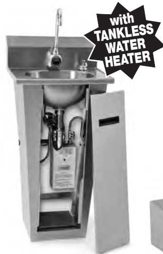
hand sink with hot water heater