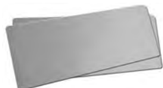
pair of end splashes for field installation