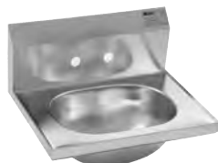
hand sink with electropolished finish

EAGLE GROUP 100 Industrial Boulevard, Clayton, DE 19938-8903 USA Phone: 302-653-3000 • Fax: 302-653-2065 www.eaglegrp.com