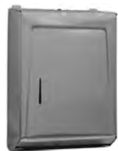
model #318496 towel dispenser