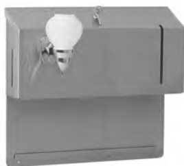
model #DP-10 towel dispenser