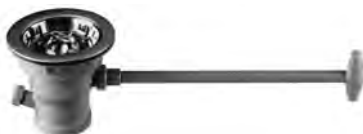
polymer rotary drain