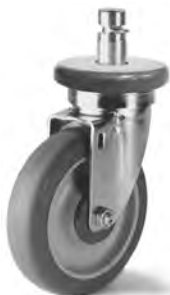
(nickel-plated) caster with polyurethane tread