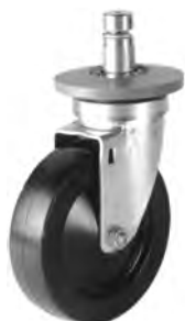
swivel caster with resilient tread

Eagle Stem Caster, model _____. For use with 1"-diameter posts. Resilient or polyurethane tread. Casters with zinc, stainless steel, and polymer boot available. For electronic handling, conductive casters available. Donut bumper included with all stem casters. Swivel casters have a temperature rating of -15°F (-26°C). Note: These stem casters cannot be used with Master Trak® Shelving.