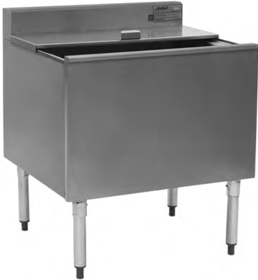
B301C-12D-22-7 ice chest

Eagle 2200 Series Ice Chests with Sealed-In Cold Plate, model _____. Top, front, backsplash and fabricated ice bin is heavy gauge type 304 stainless steel. Ice bin is fully insulated, with 1½" drain, and sealed-in 7-circuit cold plate. 1½" O.D. galvanized tubular legs with adjustable bullet feet.