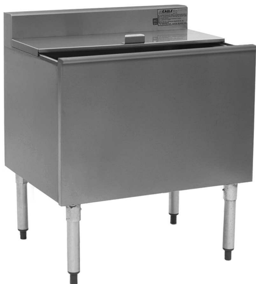
#B30IC-16D-18 ice chest with 16" (406mm)-deep ice bin

Eagle 1800 Series Ice Chests with Sealed-In Cold Plate, model _____. Top, front, backsplash and ice bin to be heavy gauge type 304 stainless steel. Fabricated ice bin is fully insulated with 1½" drain, and sealed-in 7-circuit cold plate. 1½" O.D. galvanized tubular legs with adjustable bullet feet.