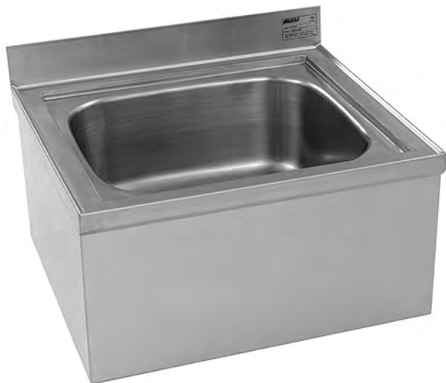
#F1916 mop sink

Eagle Floor Mounted Mop Sink, model _____. Constructed of type 304 stainless steel, with 8" or 12" deep-drawn coved corner sink with drain and flat strainer plate.