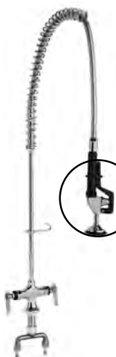
deck mounted prerinse spray unit