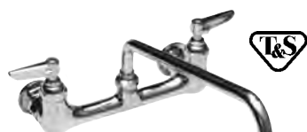
12" (305mm) T&S faucet