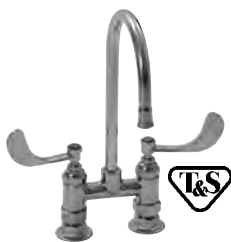
T&S wrist handle faucet