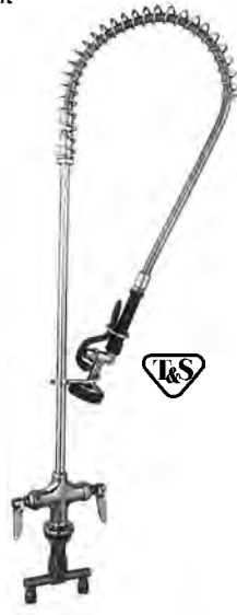
T&S deck mounted prerinse spray unit