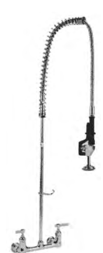
splash mounted prerinse spray unit