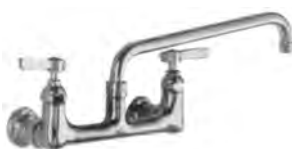
12" (305mm) heavy duty faucet