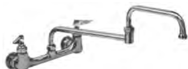
19" (483mm) double-jointed spout faucet