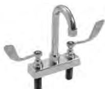
standard wrist handle faucet