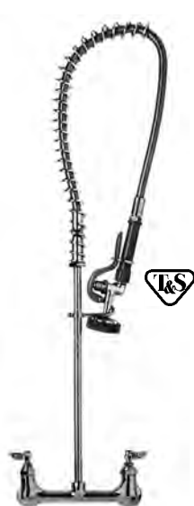
T&S splash mounted prerinse spray unit