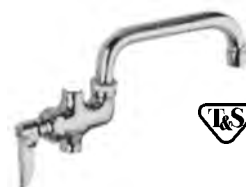
T&S prerinse faucet add-on