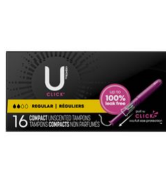
View: Flat Top_2D