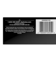
View: Flat Bottom_2D