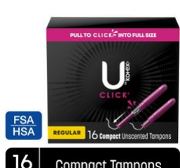
View: Online Optimized Image