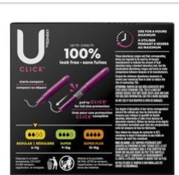
View: Flat Back_2D