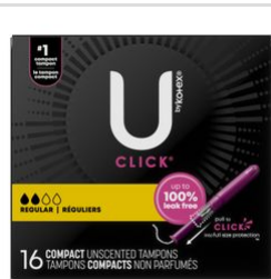
View: Flat Front_2D