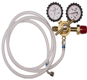
KIT, PRIMARY N2 REGULATOR