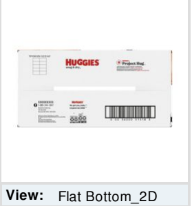
View: Flat Bottom_2D