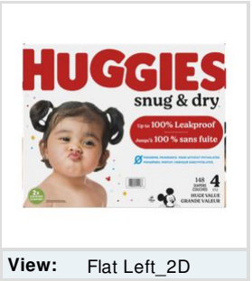
View: Flat Left_2D