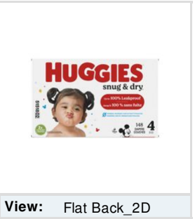
View: Flat Back_2D