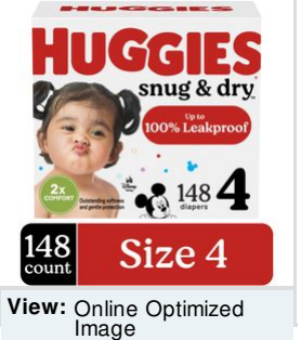
View: Online Optimized Image