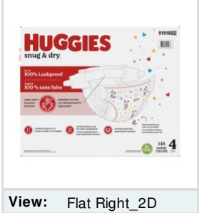
View: Flat Right_2D