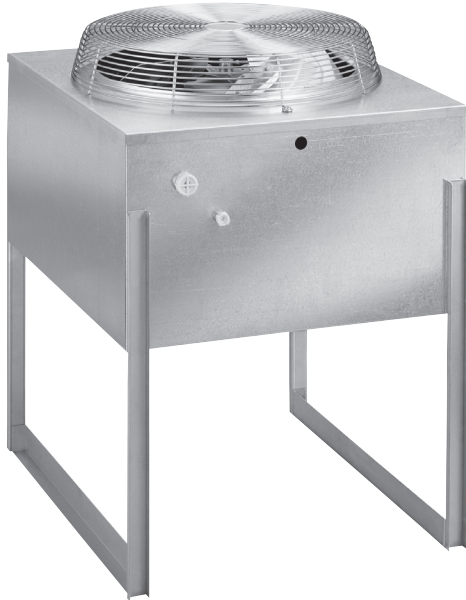
JCF900 Remote Condenser