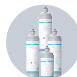
Arctic Pure Water Filters