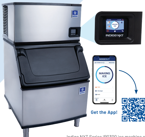
Indigo NXT Series iP0300 ice machine on D400 bin. Ice machine and bin sold separately.