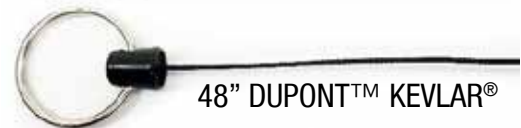
48" DUPONT™ KEVLAR®