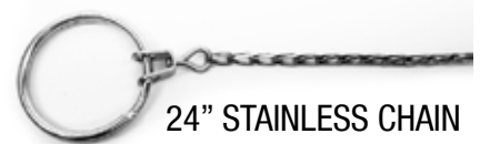
24" STAINLESS CHAIN