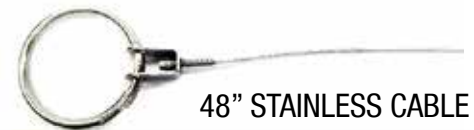
48" STAINLESS CABLE