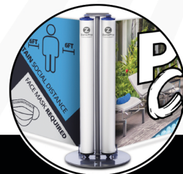
Banners swivel to a 90 degree angle in either direction

PRODUCT WEIGHT - 57lbs. | PRODUCT DIMENSIONS - 18" X 43" (retracted)