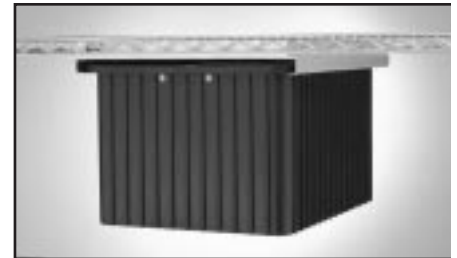
One-Piece Slide (tote sold separately)