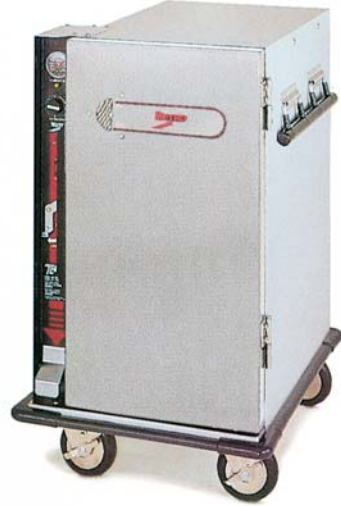
TC90S shown with bumper