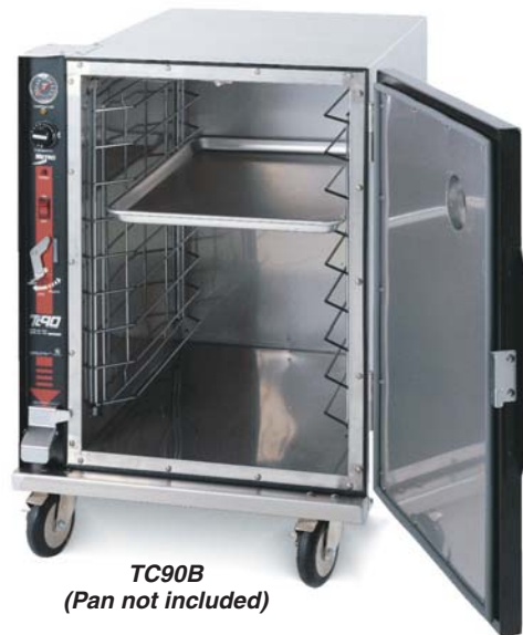
TC90B (Pan not included)