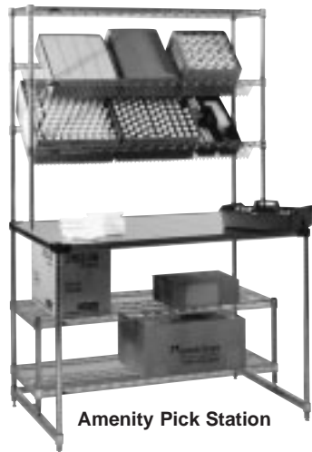
Amenity Pick Station

Amenity Pick Station/Tote Dispensing Storage