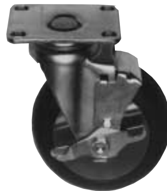
B5DNB with Wheel Brake