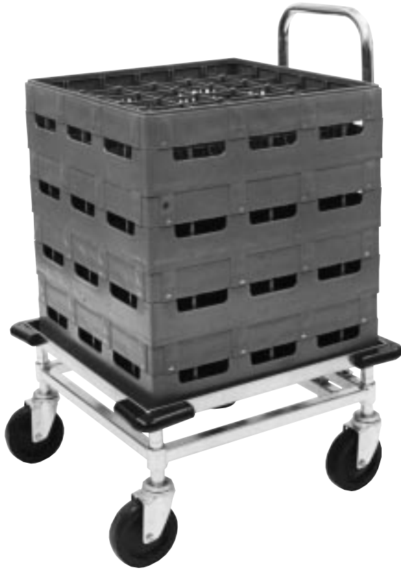
Model CBH2121C (with Sani-Stack Racks)