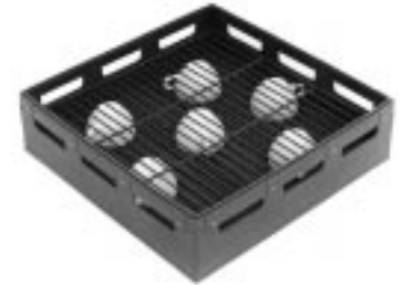
G2020 Grid in full-size rack