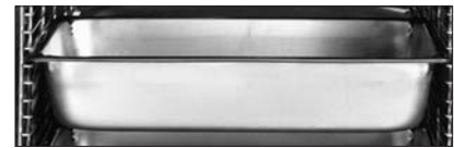
Standard Slides (Outboard)