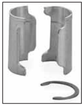
Aluminum Split Sleeve