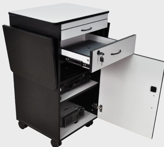
Adjustable Inner Shelf