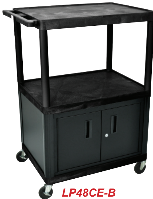
LP48CE-B 32"W x 24"D x 48 \frac{1}{4} "H