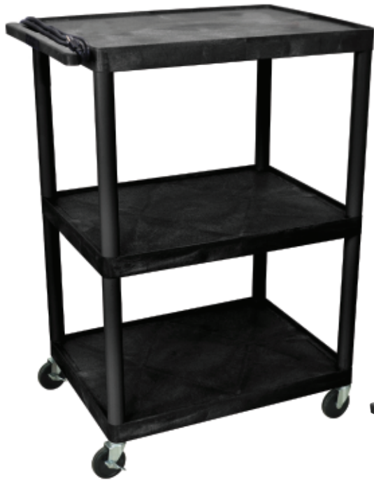
LP48E-B 32"W x 24"D x 48 \frac{1}{4} "H