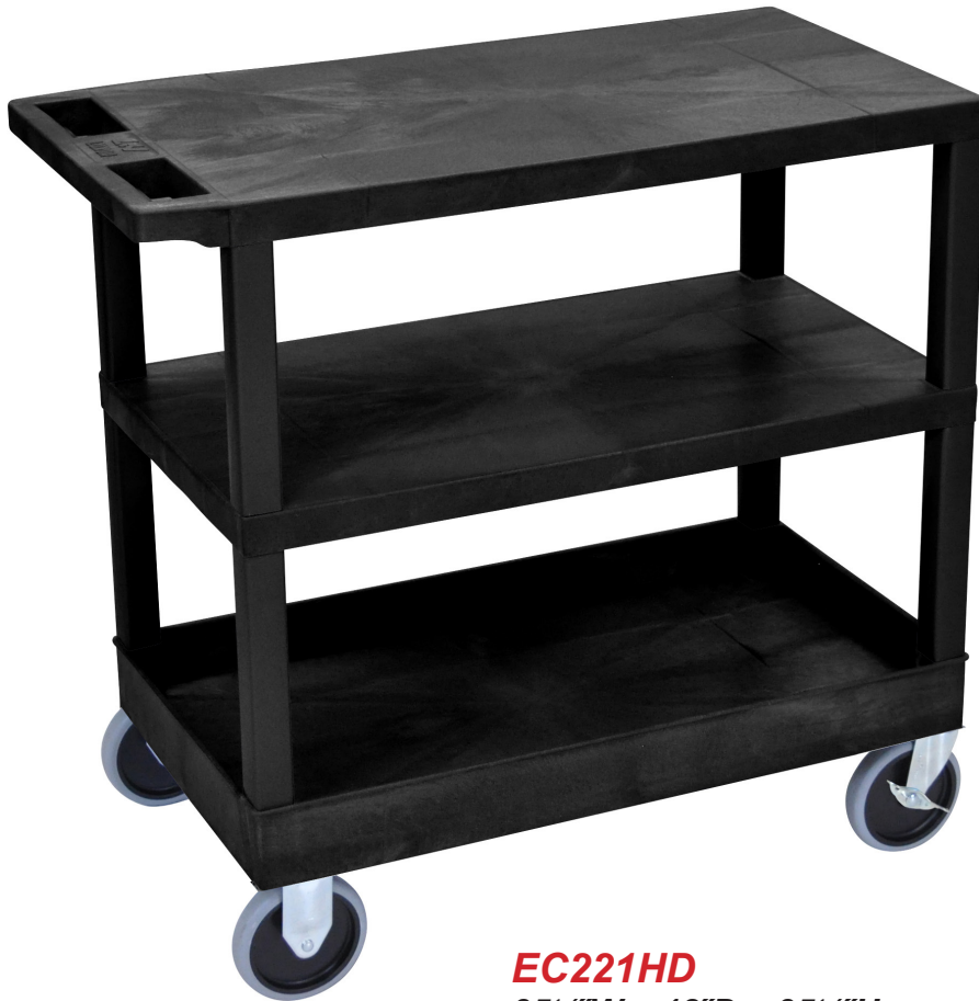
EC221HD 35¼"W x 18"D x 35½"H