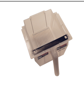
POUCHPACK FUNL AY, TEA S-T