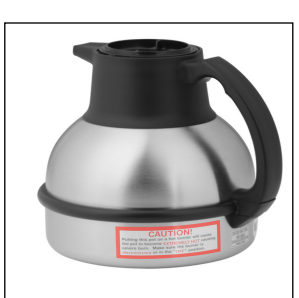
THERMAL CARAFE, BLK 1.9L 1PK