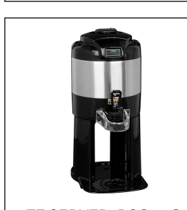
TF SERVER, DSG2 1G CD