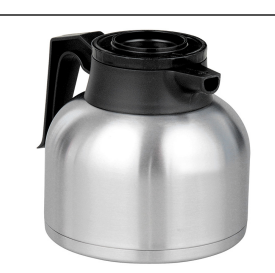
CARAFE,SST 1.9L SHRT BLK 1/