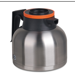
CARAFE,SST 1.9L SHRT ORN 12/