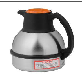
THERMAL CARAFE,ORN 1.9L 1PK