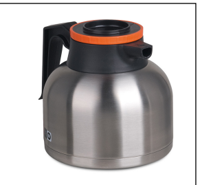
CARAFE,SST 1.9L SHRT ORN 1/