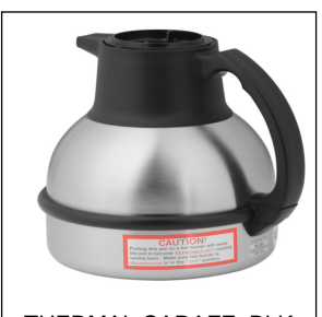
THERMAL CARAFE, BLK 1.9L 12PK