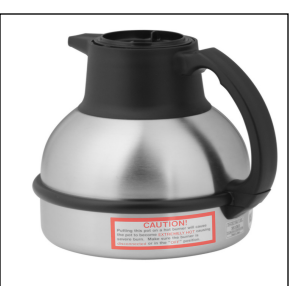
THERMAL CARAFE,ORN 1.9L 12PK