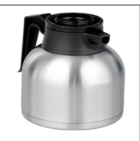
CARAFE,SST 1.9L SHRT BLK 12/