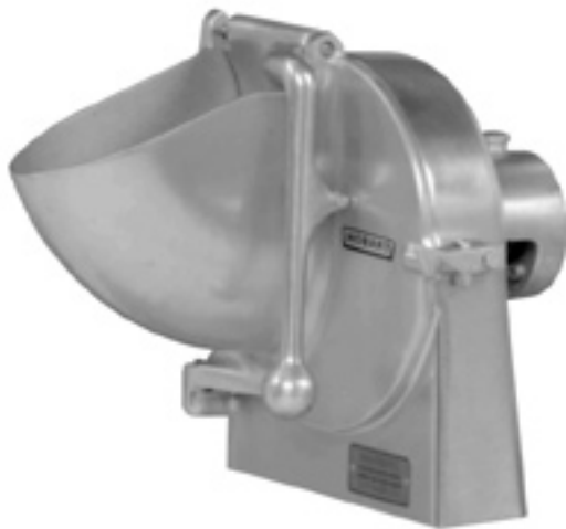
9" VEGETABLE SLICER

The 9" Vegetable Slicer may also be used with the PD-35 or PD-70 Power Drive units. PD35 – For use with cheese and vegetables. PD70 – For use with vegetables only