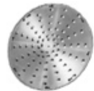
\frac{5}{16} " Shredder Plate