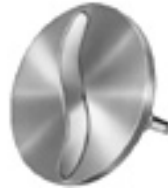
Adjustable Slice Plate - \frac{5}{8} " to very thin.