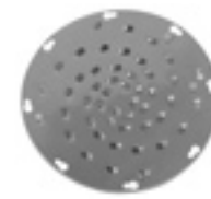
\frac{5}{16} " Shredder Plate