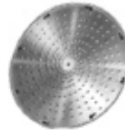
\frac{3}{32} " Shredder Plate