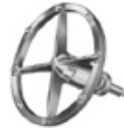
Plate Holder Assembly