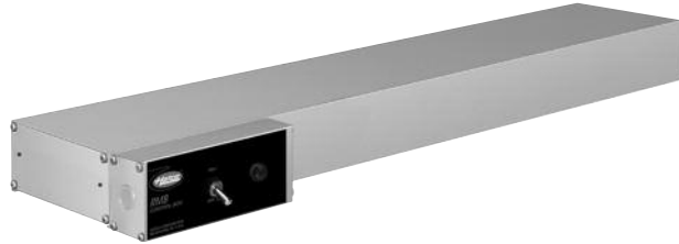
Model GRAM-18 with Control Enclosure with toggle switch and indicator light