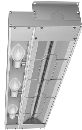
Model GRAML-36 with shatter-resistant incandescent lights, remote control enclosure (not pictured), and standard angle brackets