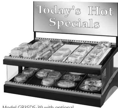
Model GR3SDS-39 with optional Designer color and accessory top sign holder (sign not included)

Equipment On Signage Program Hatcographics.com