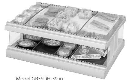
Model GR3SDH-39 in optional stainless steel