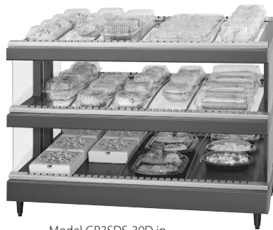
Model GR3SDS-39D in optional Designer color