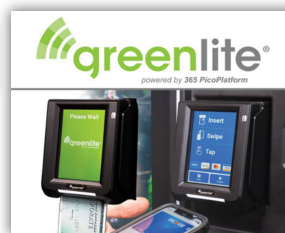
Credit/Debit & Mobile Reader