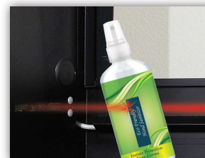
iVend® Guaranteed Delivery System

Keeps customers satisfied and reduces service calls for misloaded product.