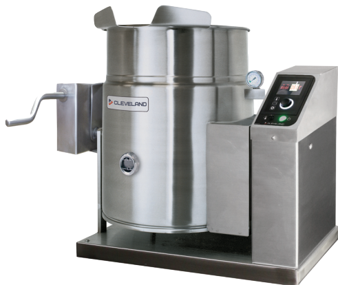
KGT-12-TGB (SHOWN WITH OPTIONAL EASYDIAL CONTROLS)