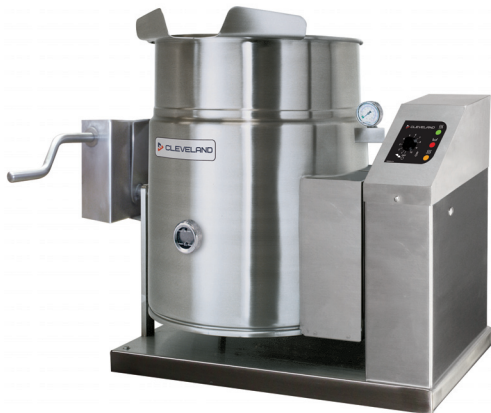
KGT-12-TGB (SHOWN WITH STANDARD CONTROLS)